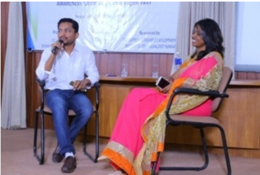
Panel Interview with 3 famous entrepreneurs