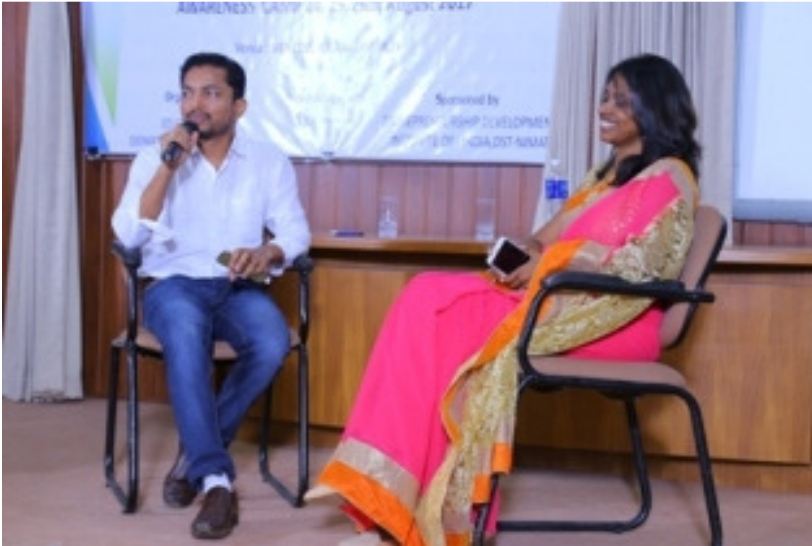
Panel Interview with 3 famous entrepreneurs