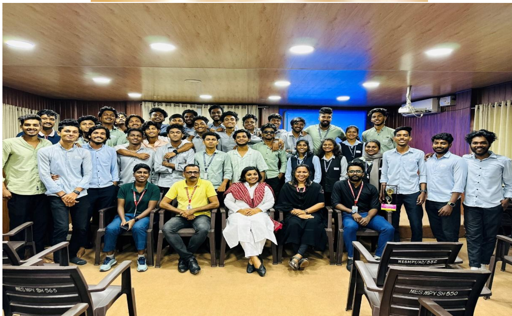
Event: IDEA PRESENTATION 2023