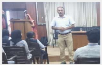
Ernakulam, Kerala, India 3CX8+GHP, Vazhakkulam, Kerala Lat 10.09824° Long 76.416355° 18/12/23 10:14 AM GMT +05:30