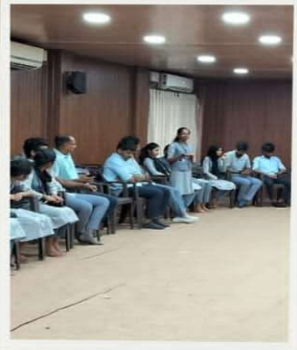
Ernakulam, Kerala, India 3CX8+GHP, Vazhakkulam, Kerala 68310 10.09824°