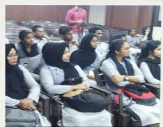
Marampally, Kerala, India 3CX8+9RX, Marampally, Kerala 68310 10.106608° Long 76.411493° 18/12/23 10:15 AM GMT +05:30